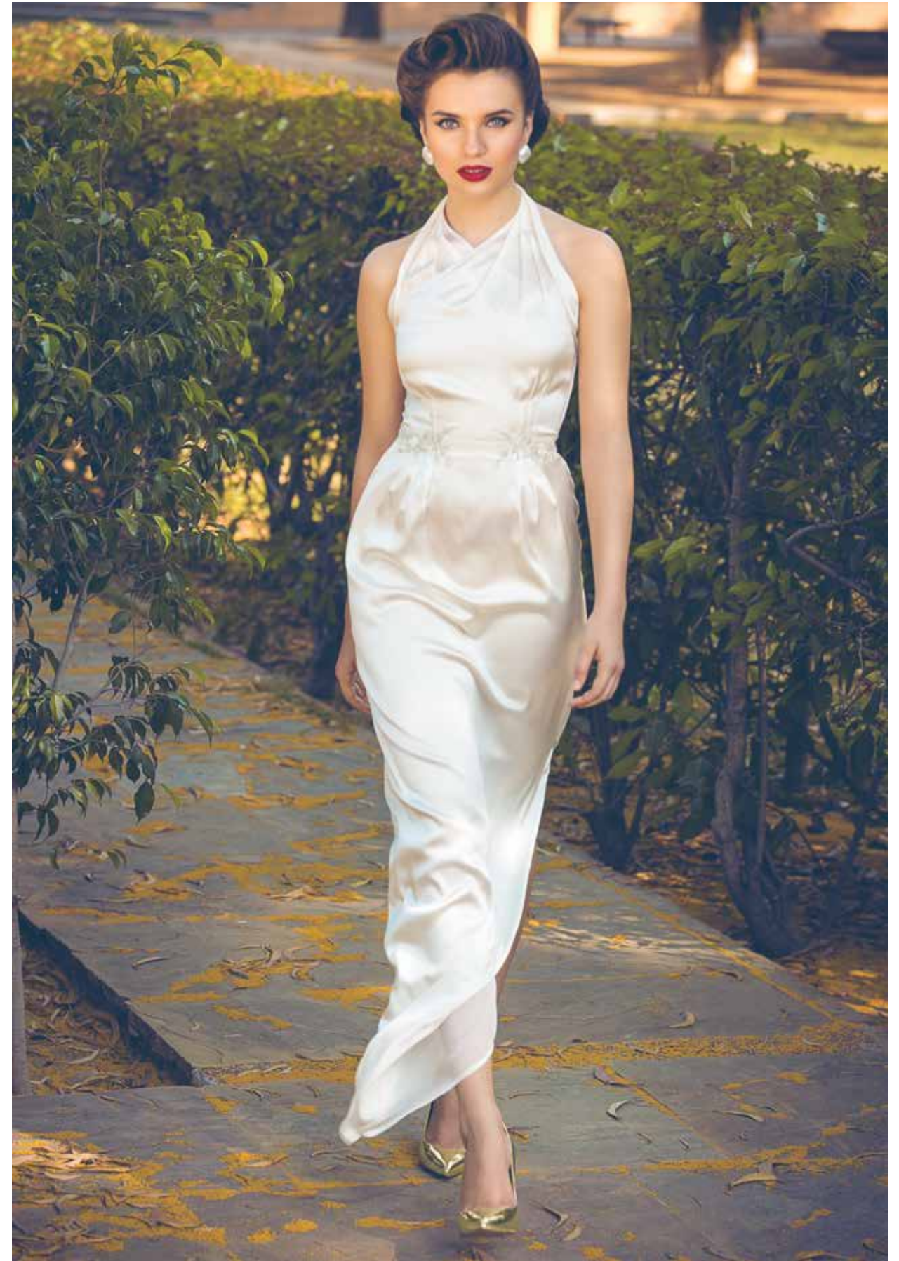
DRESS - SS16DN12