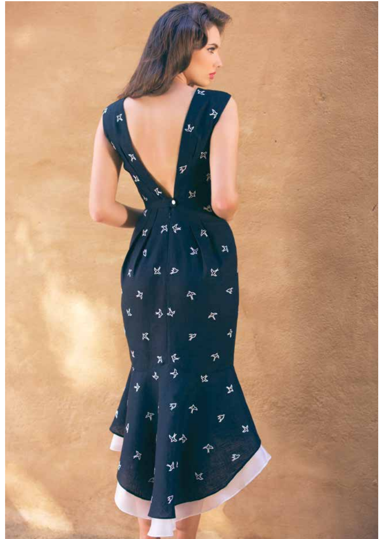
DRESS - SS16DN03