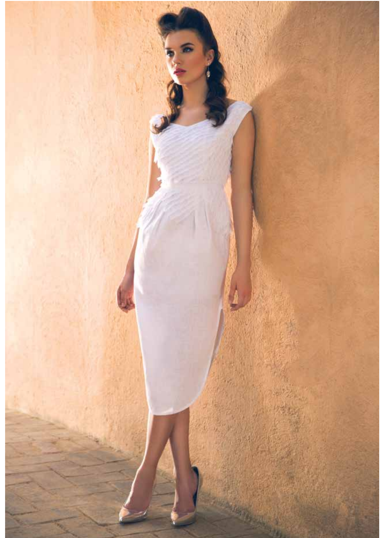
DRESS - SS16DN11