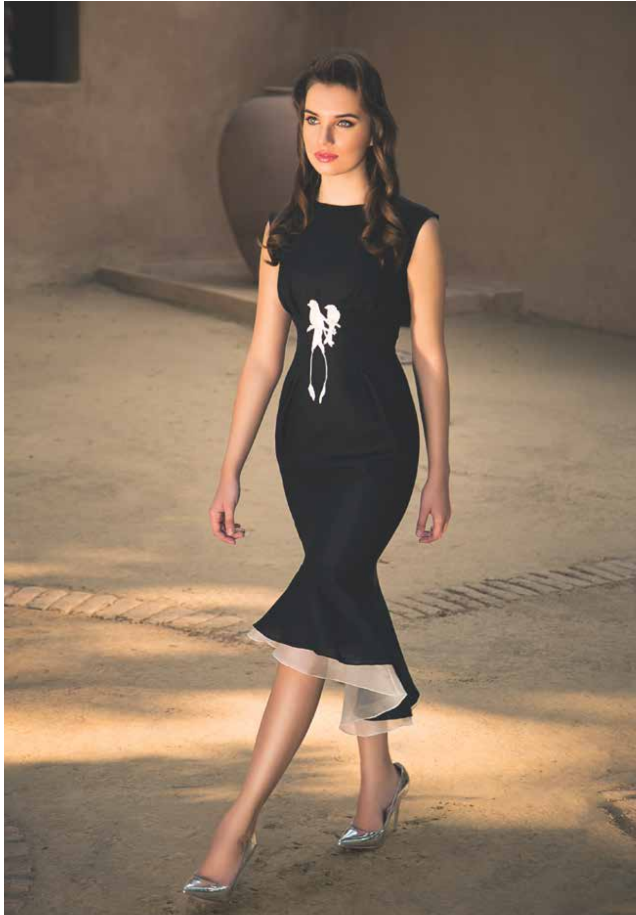
DRESS - SS16DN02

PAGE NO 10 & 11 SS16DN05- Studio Draped top in cotton silk. with asymmetric skirt in linen.