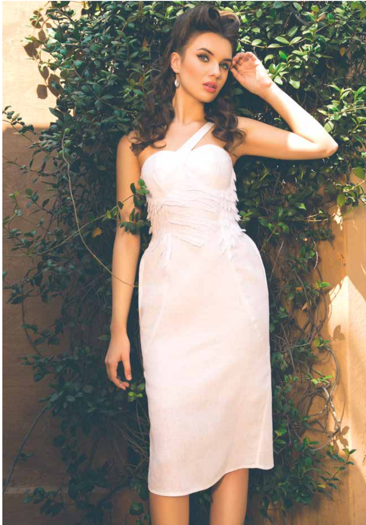
DRESS - SS16DN14