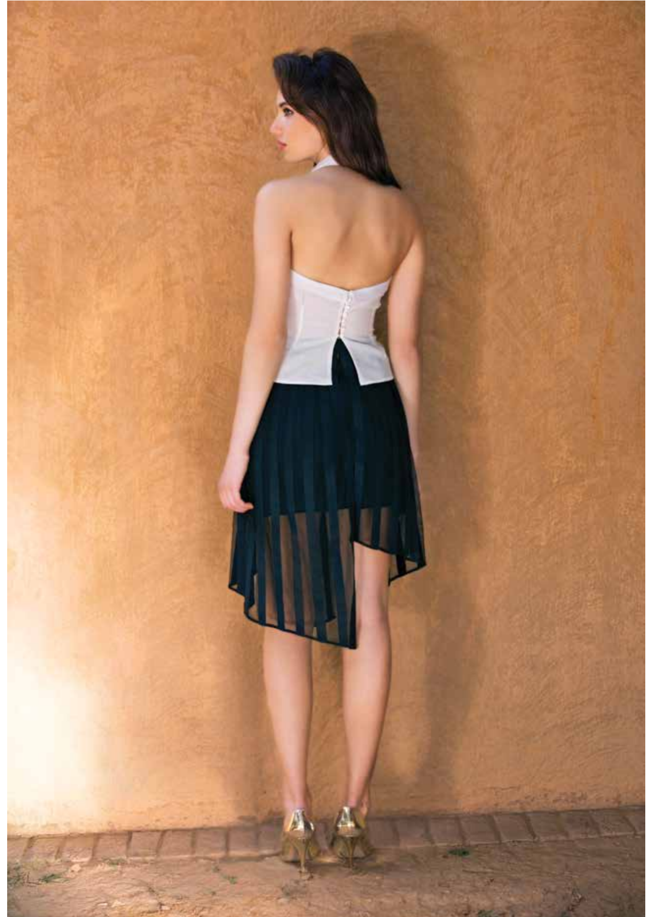
TOP & SKIRT - SS16DN05