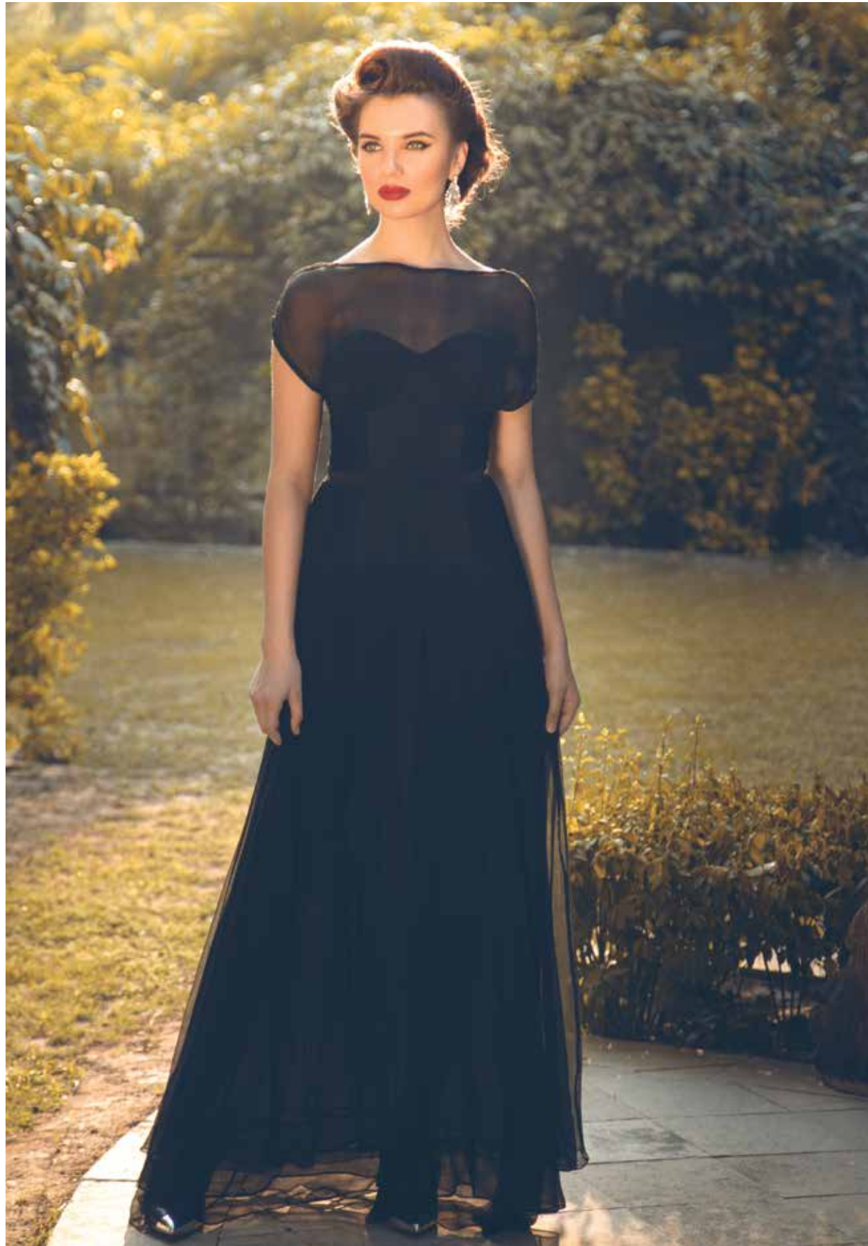
DRESS - SS16DN15